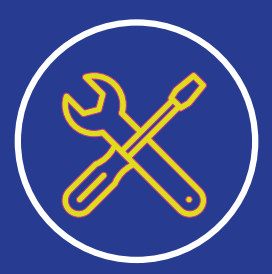
Repairs and maintenance